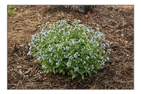
Bertram Anderson Lungwort in bloom

Bertram Anderson Lungwort is recommended for the following landscape applications;