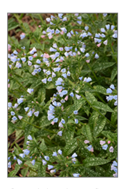
Bertram Anderson Lungwort flowers

This is a relatively low maintenance plant, and should be cut back in late fall in preparation for winter. Deer don't particularly care for this plant and will usually leave it alone in favor of tastier treats. It has no significant negative characteristics.