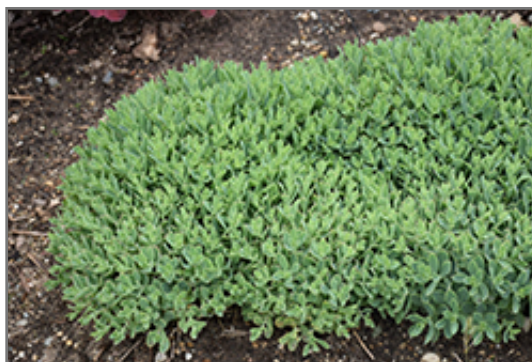
Rock 'N Round Pure Joy Stonecrop

Rock 'N Round Pure Joy Stonecrop is a fine choice for the garden, but it is also a good selection for planting in outdoor pots and containers. It is often used as a 'filler' in the 'spiller-thriller-filler' container combination, providing a mass of flowers and foliage against which the thriller plants stand out. Note that when growing plants in outdoor containers and baskets, they may require more frequent waterings than they would in the yard or garden.