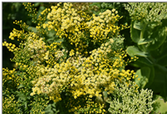
Little Lemon Goldenrod flowers