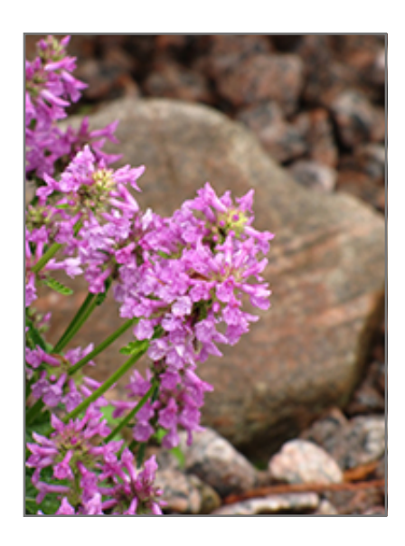
Dwarf Betony flowers

Dwarf Betony is a dense herbaceous perennial with tall flower stalks held atop a low mound of foliage. Its medium texture blends into the garden, but can always be balanced by a couple of finer or coarser plants for an effective composition.