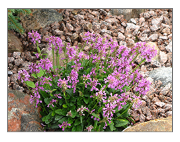
Dwarf Betony in bloom