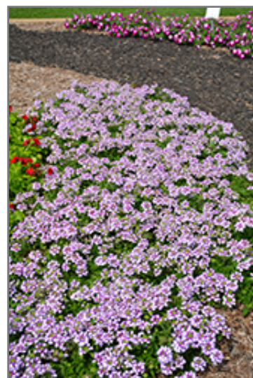
Lanai Twister Purple Verbena in bloom