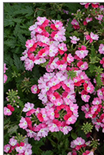
Lanai Twister Red Verbena flowers

Lanai Twister Red Verbena is recommended for the following landscape applications;