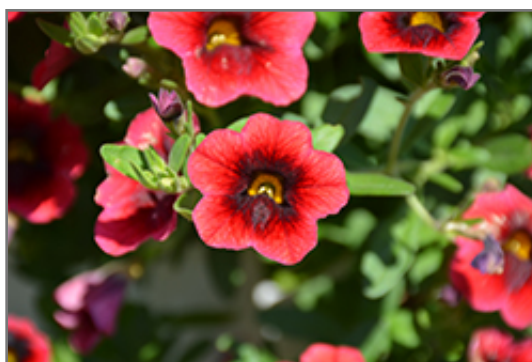
Superbells Pomegranate Punch Calibrachoa flowers