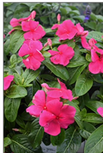
Titan Punch Vinca flowers

Titan Punch Vinca is recommended for the following landscape applications;