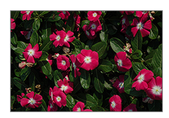
Titan Rose Halo Vinca flowers

An excellent selection featuring large blooms on uniform plants; thrives well in full sun and warm temperatures; perfect for beds, containers and hanging baskets; take care not to overwater