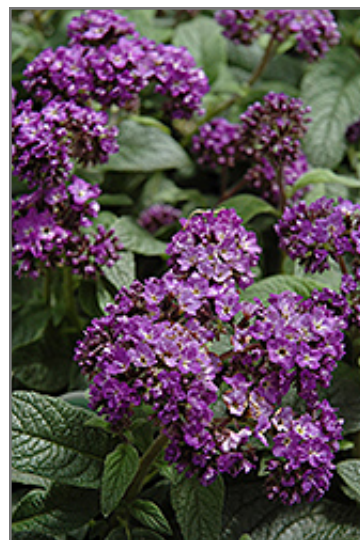
Marino Blue Heliotrope flowers

Marino Blue Heliotrope is recommended for the following landscape applications;