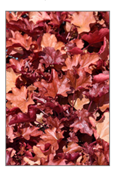
Fire Alarm Coral Bells foliage