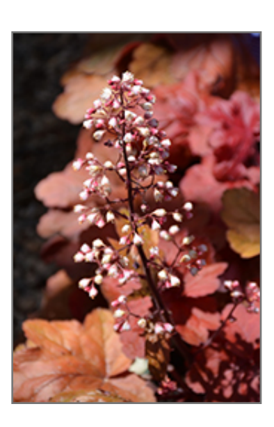
Fire Alarm Coral Bells flowers

This plant performs well in both full sun and full shade. However, you may want to keep it away from hot, dry locations that receive direct afternoon sun or which get reflected sunlight, such as against the south side of a white wall. It prefers to grow in average to moist conditions, and shouldn't be allowed to dry out. It is not particular as to soil type or pH. It is somewhat tolerant of urban pollution. Consider covering it with a thick layer of mulch in winter to protect it in exposed locations or colder microclimates. This particular variety is an interspecific hybrid. It can be propagated by division; however, as a cultivated variety, be aware that it may be subject to certain restrictions or prohibitions on propagation.