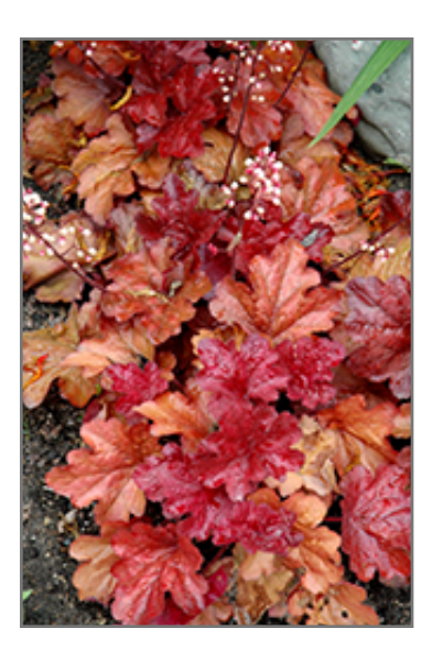
Fire Alarm Coral Bells

Fire Alarm Coral Bells is recommended for the following landscape applications;