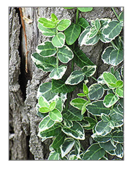
Emerald Gaiety Wintercreeper foliage