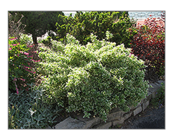
Emerald Gaiety Wintercreeper