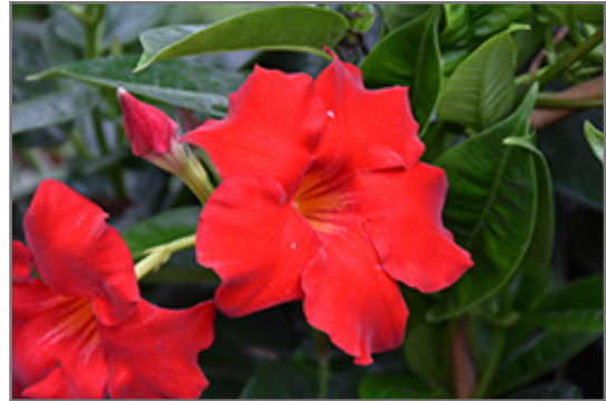
Red Mandevilla flowers

This plant does best in full sun to partial shade. It requires an evenly moist well-drained soil for optimal growth. It is not particular as to soil type or pH. It is highly tolerant of urban pollution and will even thrive in inner city environments. This particular variety is an interspecific hybrid, and parts of it are known to be toxic to humans and animals, so care should be exercised in planting it around children and pets. It can be propagated by cuttings; however, as a cultivated variety, be aware that it may be subject to certain restrictions or prohibitions on propagation.