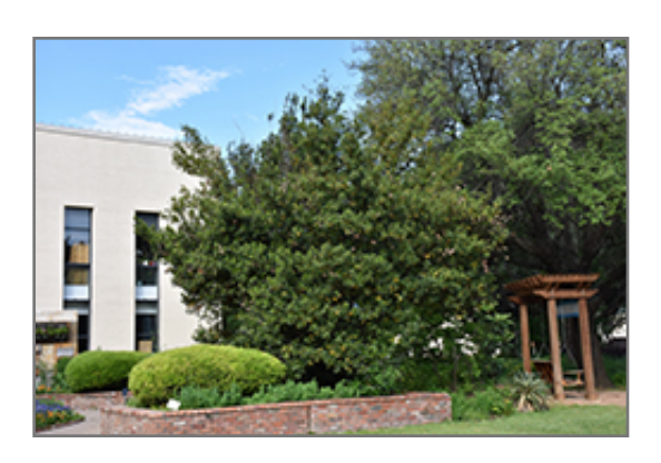
Bay Laurel

This is a relatively low maintenance tree, and can be pruned at anytime. It is a good choice for attracting bees and butterflies to your yard, but is not particularly attractive to deer who tend to leave it alone in favor of tastier treats. It has no significant negative characteristics.