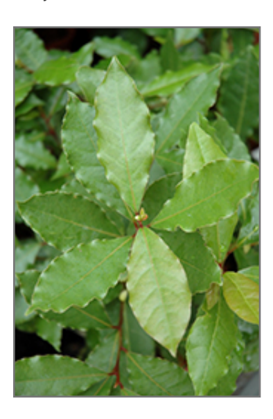
Bay Laurel foliage