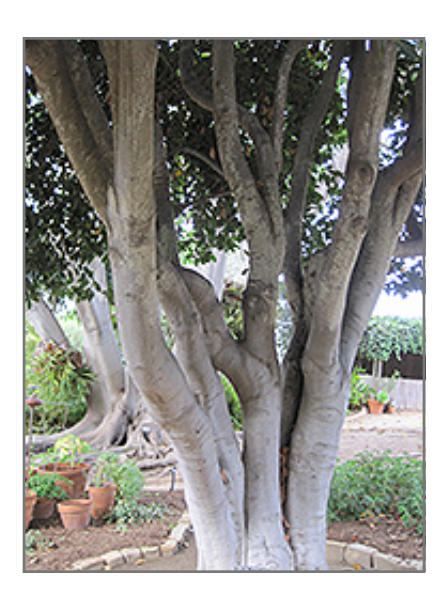
Bay Laurel bark

This tree does best in full sun to partial shade. It does best in average to evenly moist conditions, but will not tolerate standing water. It is not particular as to soil type or pH. It is somewhat tolerant of urban pollution. This species is not originally from North America. It can be propagated by cuttings.