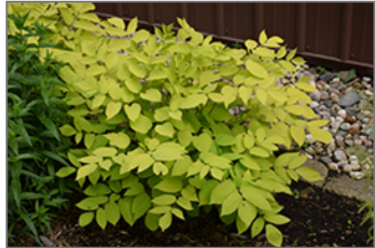
Sun King Japanese Spikenard