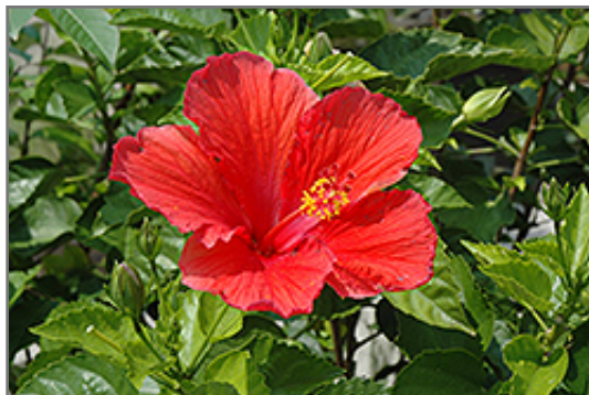
Red Hibiscus flowers

This plant does best in full sun to partial shade. It requires an evenly moist well-drained soil for optimal growth, but will die in standing water. It is not particular as to soil type or pH. It is highly tolerant of urban pollution and will even thrive in inner city environments. Consider applying a thick mulch around the root zone in winter to protect it in exposed locations or colder microclimates. This is a selected variety of a species not originally from North America. It can be propagated by cuttings; however, as a cultivated variety, be aware that it may be subject to certain restrictions or prohibitions on propagation.