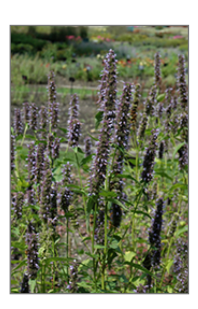
Black Adder Hyssop flowers

Airy dark purple spikes of smokey lavender flowers complement coarser textured perennials in the garden; attracts hummingbirds and other pollinators; aromatic, licorice scented green foliage; pinch in June to keep plants compact