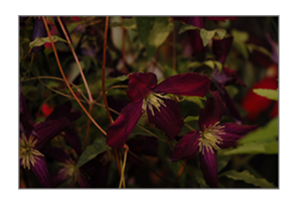
Sweet Summer Love Clematis flowers

An abundantly-flowering selection that blooms over a long period from early summer to fall; deep cranberry-purple blooms with butter-cream centers; a great repeat bloomer, perfect for arbors, containers and baskets