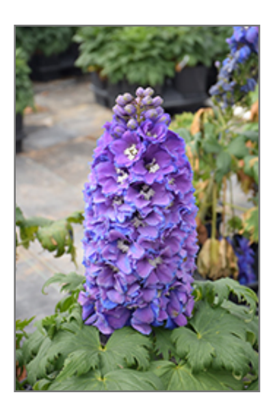
Guardian Blue Larkspur flowers