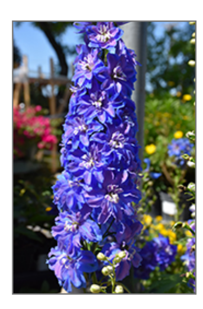
Guardian Blue Larkspur flowers