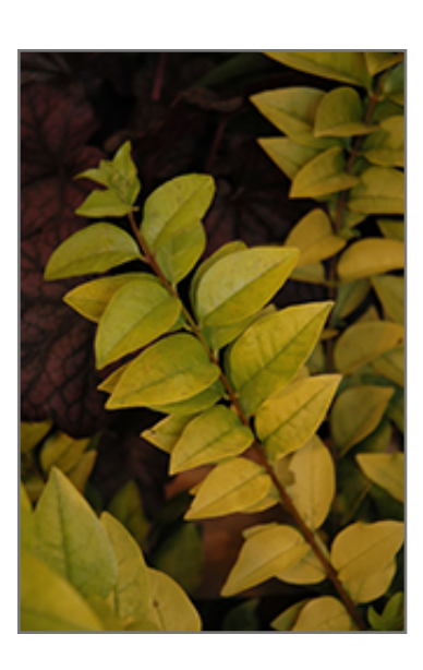
Golden Ticket Privet foliage

Golden Ticket Privet has attractive gold deciduous foliage on a plant with an upright spreading habit of growth. The glossy pointy leaves are highly ornamental but do not develop any appreciable fall color. It has panicles of lightly-scented white flowers hanging below the branches from late spring to early summer.