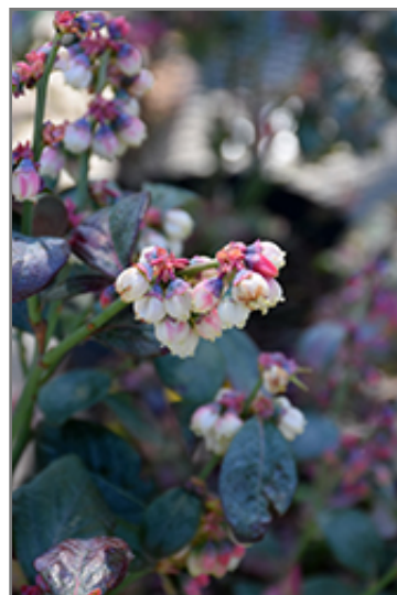
Pink Icing Blueberry flowers

This shrub is quite ornamental as well as edible, and is as much at home in a landscape or flower garden as it is in a designated edibles garden. It does best in full sun to partial shade. It does best in average to evenly moist conditions, but will not tolerate standing water. It is very fussy about its soil conditions and must have sandy, acidic soils to ensure success, and is subject to chlorosis (yellowing) of the foliage in alkaline soils. It is quite intolerant of urban pollution, therefore inner city or urban streetside plantings are best avoided, and will benefit from being planted in a relatively sheltered location. Consider applying a thick mulch around the root zone in winter to protect it in exposed locations or colder microclimates. This particular variety is an interspecific hybrid.