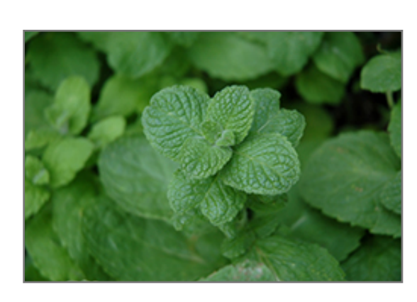
Apple Mint foliage

This culinary herb is also great as an ornamental plant; rounded, crinkled, rich green foliage; white flower spikes in mid-summer to early fall; great in containers and herb gardens; guard against rapid invasiveness by using container in the ground