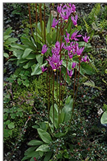
Shooting Star in bloom