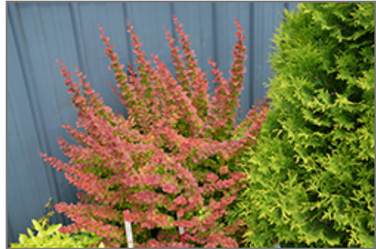
Sunjoy Tangelo Japanese Barberry

Sunjoy Tangelo Japanese Barberry makes a fine choice for the outdoor landscape, but it is also well-suited for use in outdoor pots and containers. Because of its height, it is often used as a 'thriller' in the 'spiller-thriller-filler' container combination; plant it near the center of the pot, surrounded by smaller plants and those that spill over the edges. It is even sizeable enough that it can be grown alone in a suitable container. Note that when grown in a container, it may not perform exactly as indicated on the tag - this is to be expected. Also note that when growing plants in outdoor containers and baskets, they may require more frequent waterings than they would in the yard or garden.