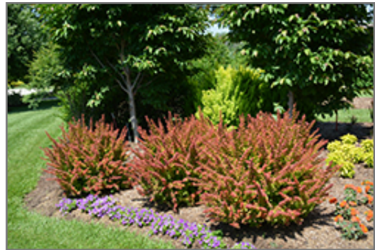
Sunjoy Tangelo Japanese Barberry