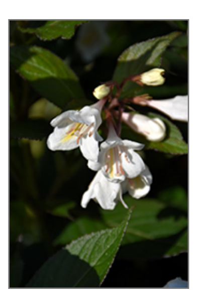
Tuxedo Weigela flowers

Tuxedo Weigela makes a fine choice for the outdoor landscape, but it is also well-suited for use in outdoor pots and containers. Because of its height, it is often used as a 'thriller' in the 'spiller-thriller-filler' container combination; plant it near the center of the pot, surrounded by smaller plants and those that spill over the edges. It is even sizeable enough that it can be grown alone in a suitable container. Note that when grown in a container, it may not perform exactly as indicated on the tag - this is to be expected. Also note that when growing plants in outdoor containers and baskets, they may require more frequent waterings than they would in the yard or garden.