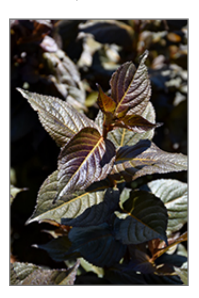
Tuxedo Weigela foliage