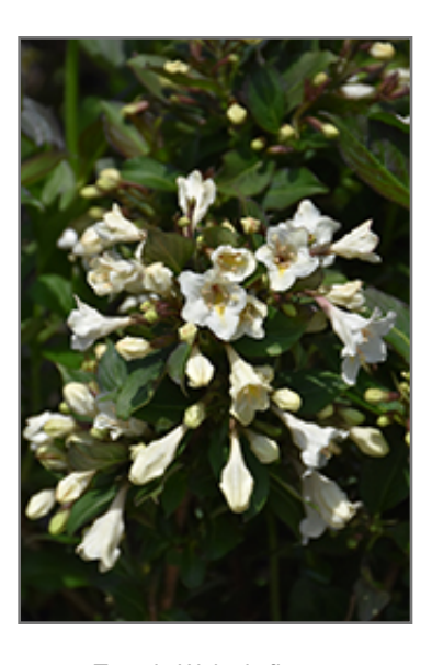
Tuxedo Weigela flowers

Tuxedo Weigela is recommended for the following landscape applications;