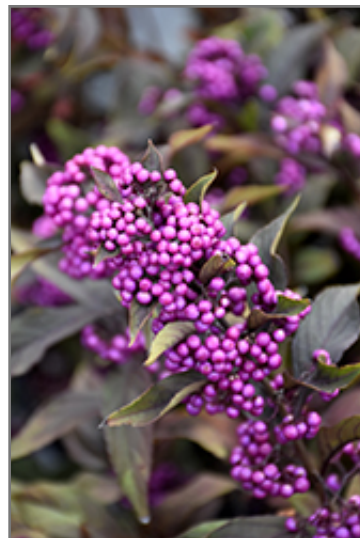
Pearl Glam Beautyberry fruit