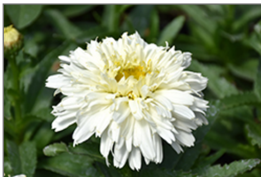
Macaroon Shasta Daisy flowers