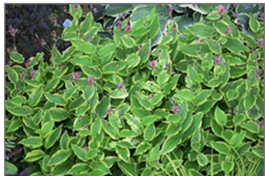
Autumn Glow Toad Lily in bloom