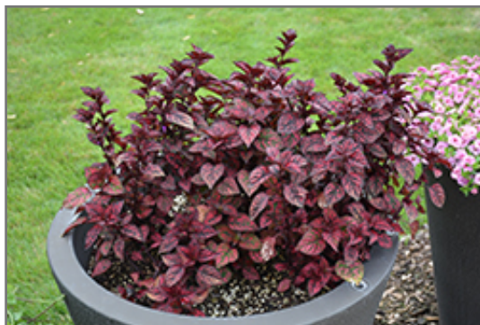
Hippo Red Polka Dot Plant