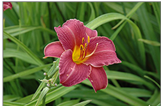
Little Wine Cup Daylily flowers