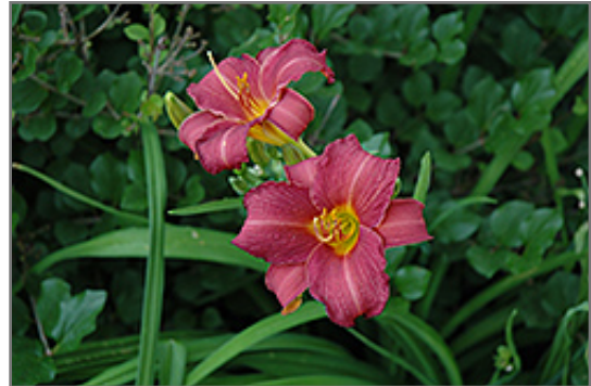
Little Wine Cup Daylily flowers

Little Wine Cup Daylily is recommended for the following landscape applications;