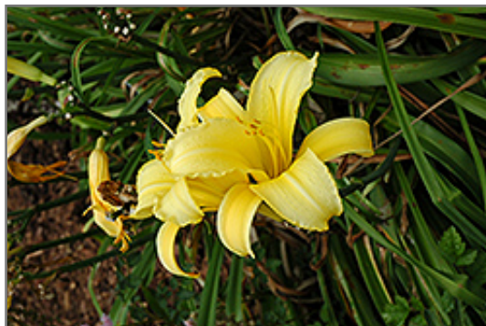
Mary Todd Daylily flowers

An early blooming selection that features large, pale yellow flowers with elegantly ruffled edges; flowers contrast beautifully against arching green foliage; low maintenance and easy to grow, perfect for borders, beds and containers