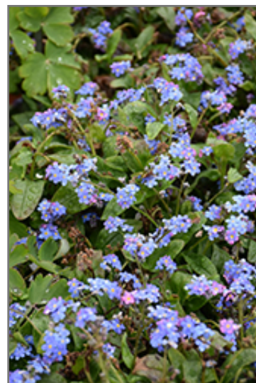
Victoria Blue Forget-Me-Not flowers

Victoria Blue Forget-Me-Not is recommended for the following landscape applications;