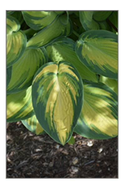
June Hosta foliage

June Hosta will grow to be about 18 inches tall at maturity extending to 24 inches tall with the flowers, with a spread of 3 feet. When grown in masses or used as a bedding plant, individual plants should be spaced approximately 30 inches apart. Its foliage tends to remain dense right to the ground, not requiring facer plants in front. It grows at a medium rate, and under ideal conditions can be expected to live for approximately 10 years. As an herbaceous perennial, this plant will usually die back to the crown each winter, and will regrow from the base each spring. Be careful not to disturb the crown in late winter when it may not be readily seen!