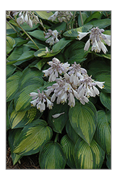
June Hosta flowers