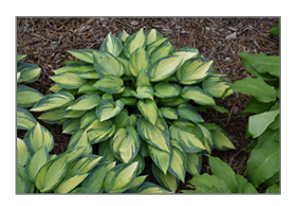
June Hosta

This is a relatively low maintenance plant, and is best cleaned up in early spring before it resumes active growth for the season. Gardeners should be aware of the following characteristic(s) that may warrant special consideration: