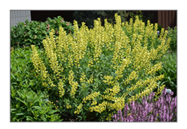
American Goldfinch False Indigo in bloom

American Goldfinch False Indigo will grow to be about 3 feet tall at maturity, with a spread of 5 feet. It tends to be leggy, with a typical clearance of 1 foot from the ground, and should be underplanted with lower-growing perennials. It grows at a slow rate, and under ideal conditions can be expected to live for approximately 25 years. As an herbaceous perennial, this plant will usually die back to the crown each winter, and will regrow from the base each spring. Be careful not to disturb the crown in late winter when it may not be readily seen!