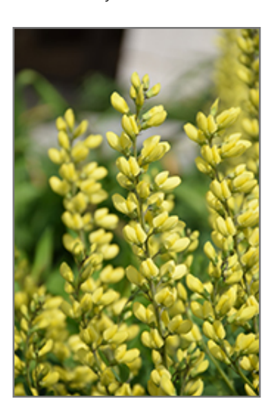
American Goldfinch False Indigo flowers