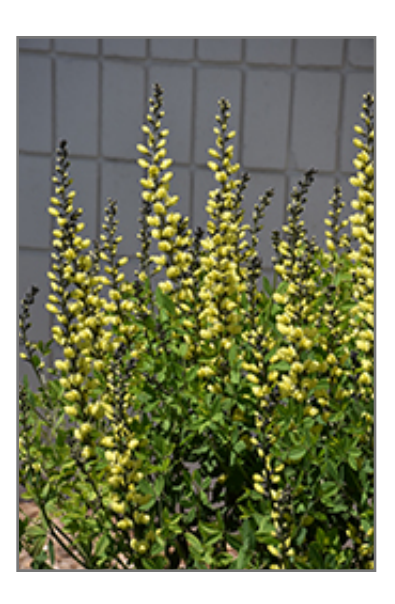
American Goldfinch False Indigo flowers

This is a relatively low maintenance plant, and is best cleaned up in early spring before it resumes active growth for the season. It is a good choice for attracting bees and butterflies to your yard, but is not particularly attractive to deer who tend to leave it alone in favor of tastier treats. It has no significant negative characteristics.