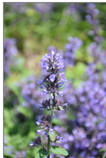
Cat's Pajamas Catmint flowers

Cat's Pajamas Catmint is recommended for the following landscape applications;