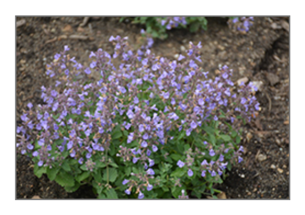
Kitten Around Catmint in bloom

Kitten Around Catmint is a dense herbaceous perennial with a mounded form. Its relatively fine texture sets it apart from other garden plants with less refined foliage.