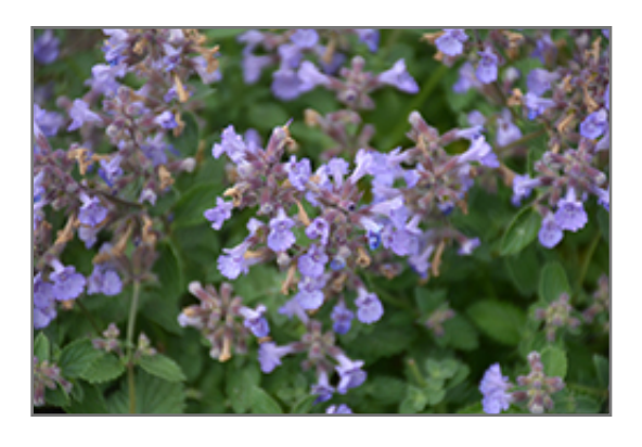
Kitten Around Catmint flowers

This plant will require occasional maintenance and upkeep, and is best cleaned up in early spring before it resumes active growth for the season. It is a good choice for attracting butterflies to your yard, but is not particularly attractive to deer who tend to leave it alone in favor of tastier treats. Gardeners should be aware of the following characteristic(s) that may warrant special consideration;