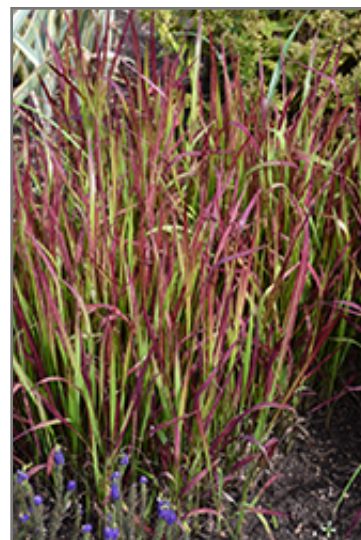
Red Baron Japanese Blood Grass foliage