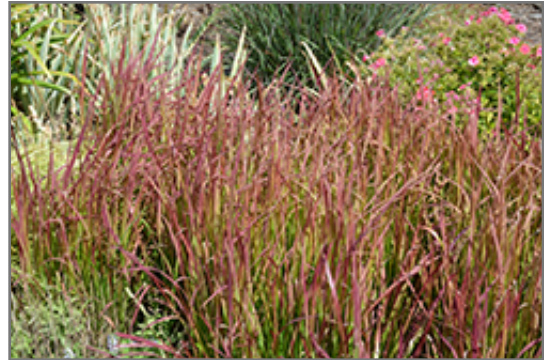
Red Baron Japanese Blood Grass

Red Baron Japanese Blood Grass will grow to be about 20 inches tall at maturity, with a spread of 18 inches. It grows at a slow rate, and under ideal conditions can be expected to live for approximately 20 years. As an herbaceous perennial, this plant will usually die back to the crown each winter, and will regrow from the base each spring. Be careful not to disturb the crown in late winter when it may not be readily seen!