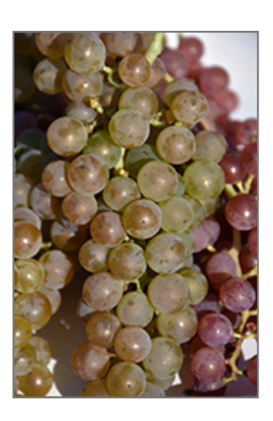
Itasca Grape fruit