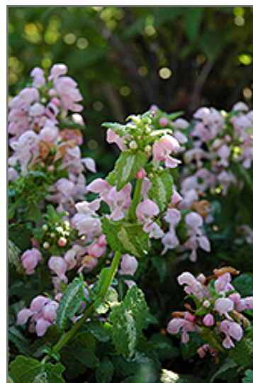
Shell Pink Spotted Dead Nettle flowers