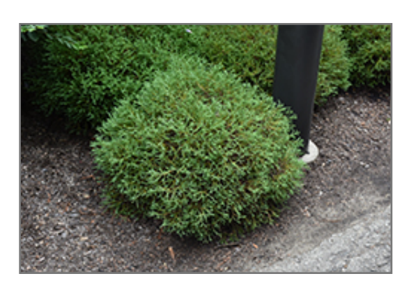
Pancake Arborvitae

As its name implies, this is a finely textured dwarf form with a dense, low, rounded habit; newer green foliage will tint blue in fall and winter; perfect for rock gardens, as a low border, or as a hedge; easy to maintain