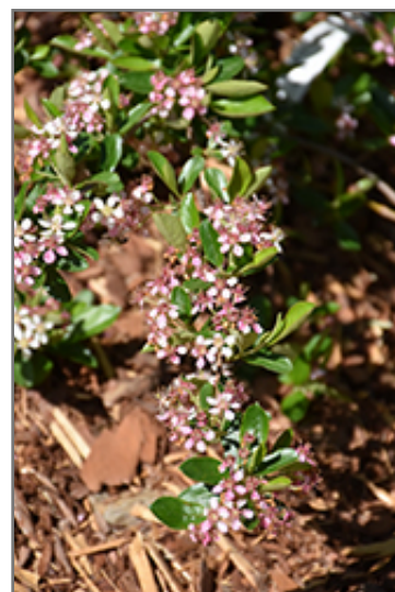
Ground Hug Aronia flowers