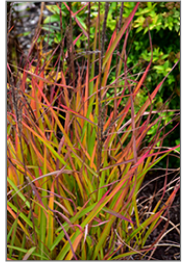
Flame Grass in fall

* This is a 'special order' plant - contact store for details