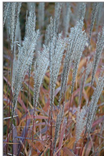
Flame Grass fruit