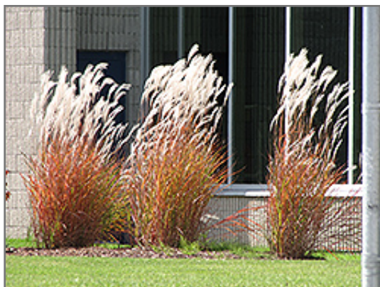
Flame Grass in bloom