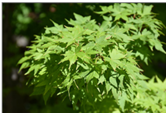
Winter Flame Japanese Maple foliage

This is a relatively low maintenance tree, and should only be pruned in summer after the leaves have fully developed, as it may 'bleed' sap if pruned in late winter or early spring. It has no significant negative characteristics.