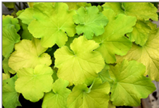
Guacamole Coral Bells foliage