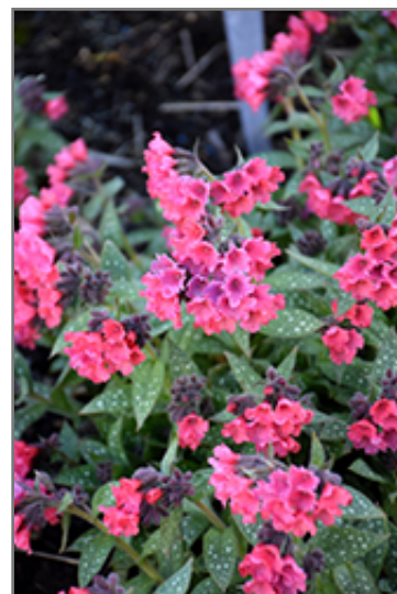
Shrimps On The Barbie Lungwort flowers

This is a relatively low maintenance plant, and should be cut back in late fall in preparation for winter. It is a good choice for attracting bees, butterflies and hummingbirds to your yard, but is not particularly attractive to deer who tend to leave it alone in favor of tastier treats. It has no significant negative characteristics.