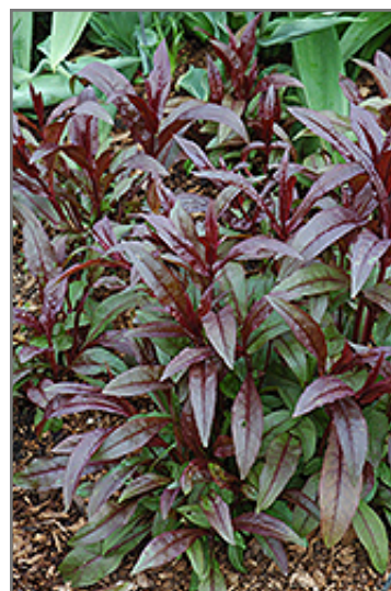
Husker Red Beard Tongue foliage