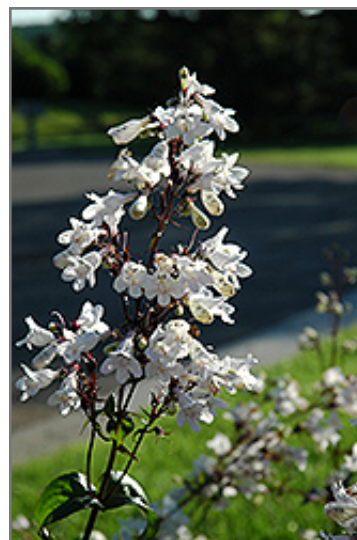
Husker Red Beard Tongue flowers