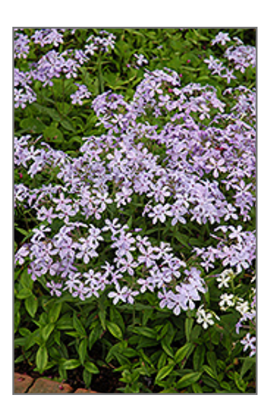
Woodland Phlox flowers