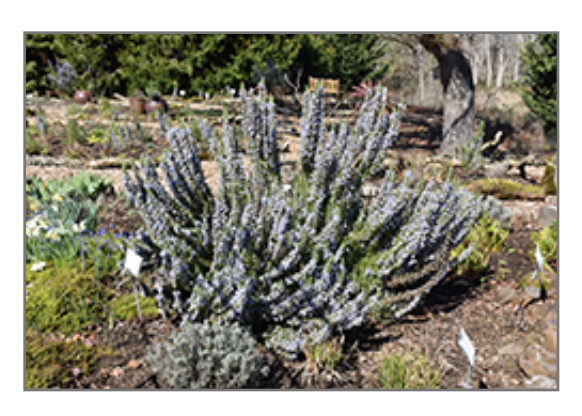
Rosemary in bloom