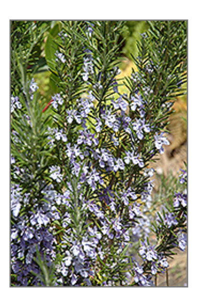
Rosemary flowers

Rosemary is a good choice for the edible garden, but it is also well-suited for use in outdoor pots and containers. With its upright habit of growth, it is best suited for use as a 'thriller' in the 'spiller-thriller-filler' container combination; plant it near the center of the pot, surrounded by smaller plants and those that spill over the edges. It is even sizeable enough that it can be grown alone in a suitable container. Note that when growing plants in outdoor containers and baskets, they may require more frequent waterings than they would in the yard or garden.