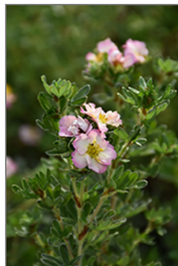
Happy Face Hearts Potentilla flowers