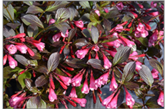
Very Fine Wine Weigela flowers

Very Fine Wine Weigela is recommended for the following landscape applications;